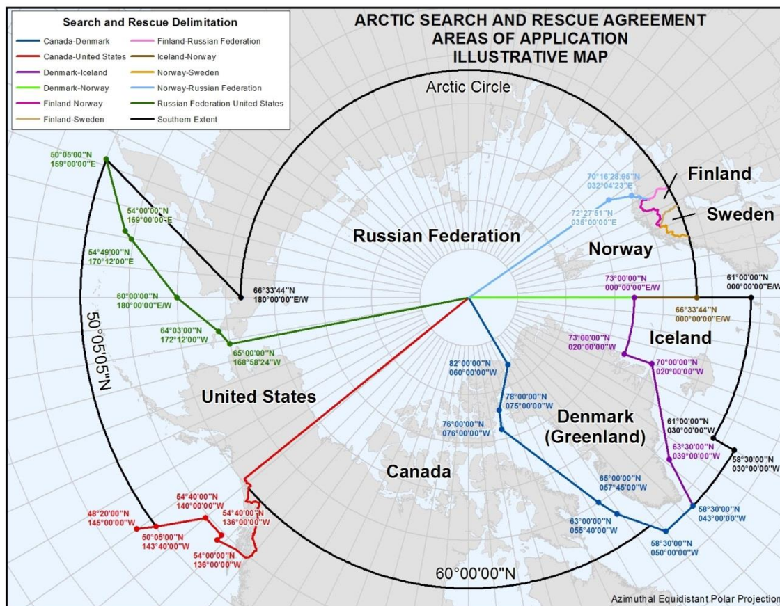
Figure 4. Illustrative Map of Arctic SAR Areas in Arctic SAR Agreement (Based on geographic coordinates listed in the agreement)

Source: "Arctic Search and Rescue Agreement," accessed July 7, 2011, at http://www.arcticportal.org/features/features-of-2011/arctic-search-and-rescue-agreement .