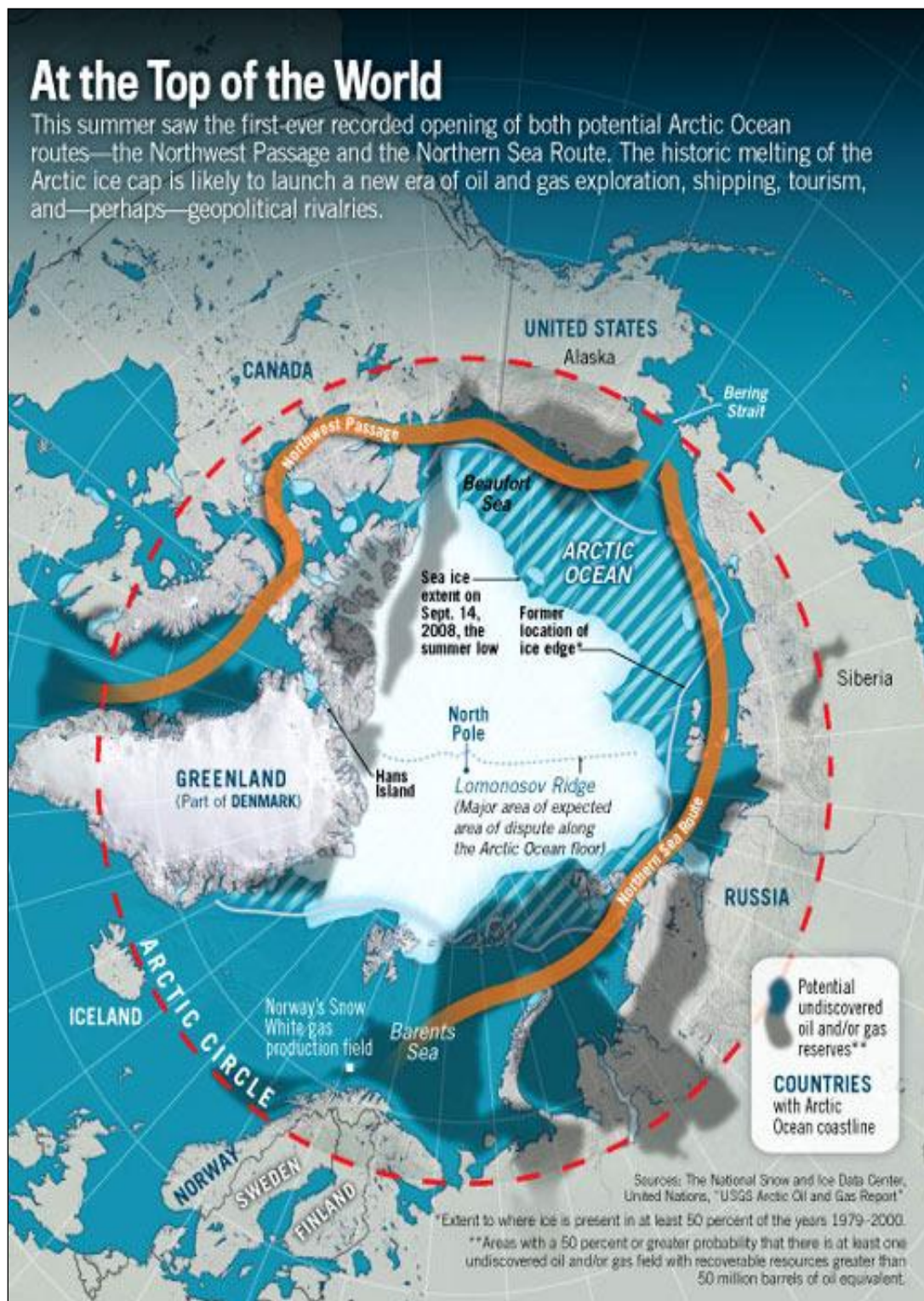
Figure 3. Arctic Sea Ice Extent in September 2008, Compared with Prospective Shipping Routes and Oil and Gas Resources