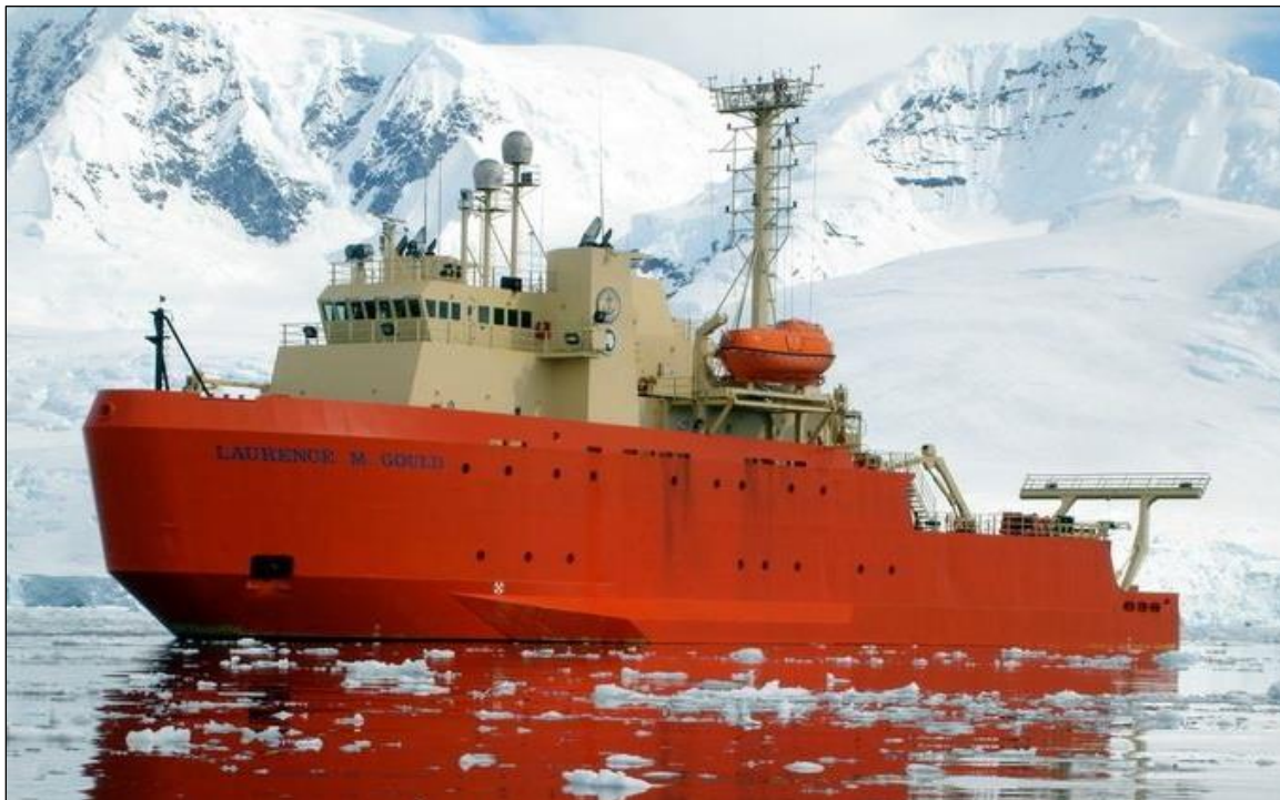
Figure A-5. Laurence M. Gould