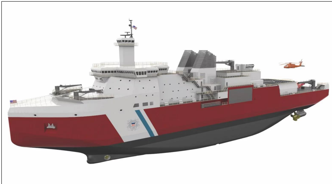
Figure 1. Rendering of VT Halter Design for PSC

Source: Illustration accompanying Sam LaGrone, "UPDATED: VT Halter Marine to Build New Coast Guard Icebreaker," USNI News , April 23, 2019, updated April 24, 2019. The caption to the illustration states "An artist's rendering of VT Halter Marine's winning bid for the U.S. Coast Guard Polar Security Cutter. VT Halter Marine image used with permission."