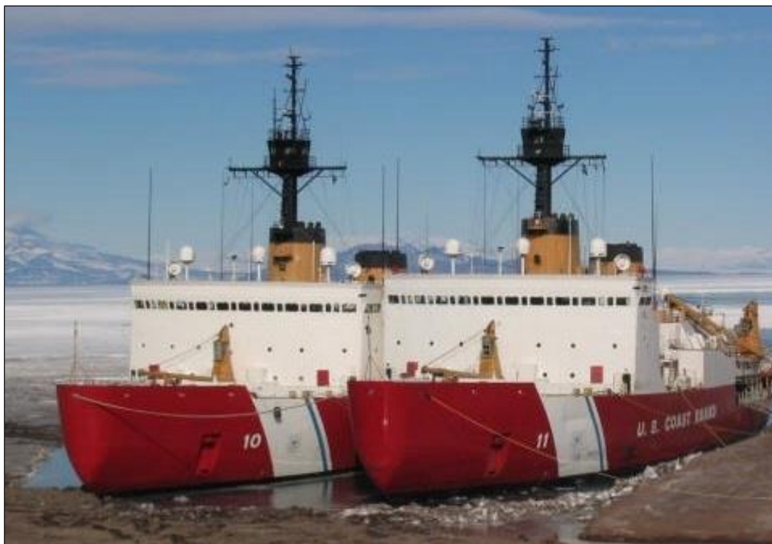
Figure A-1. Polar Star and Polar Sea (Side by side in McMurdo Sound, Antarctica)