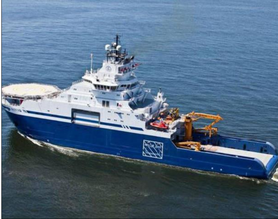
Figure 5. Aiviq