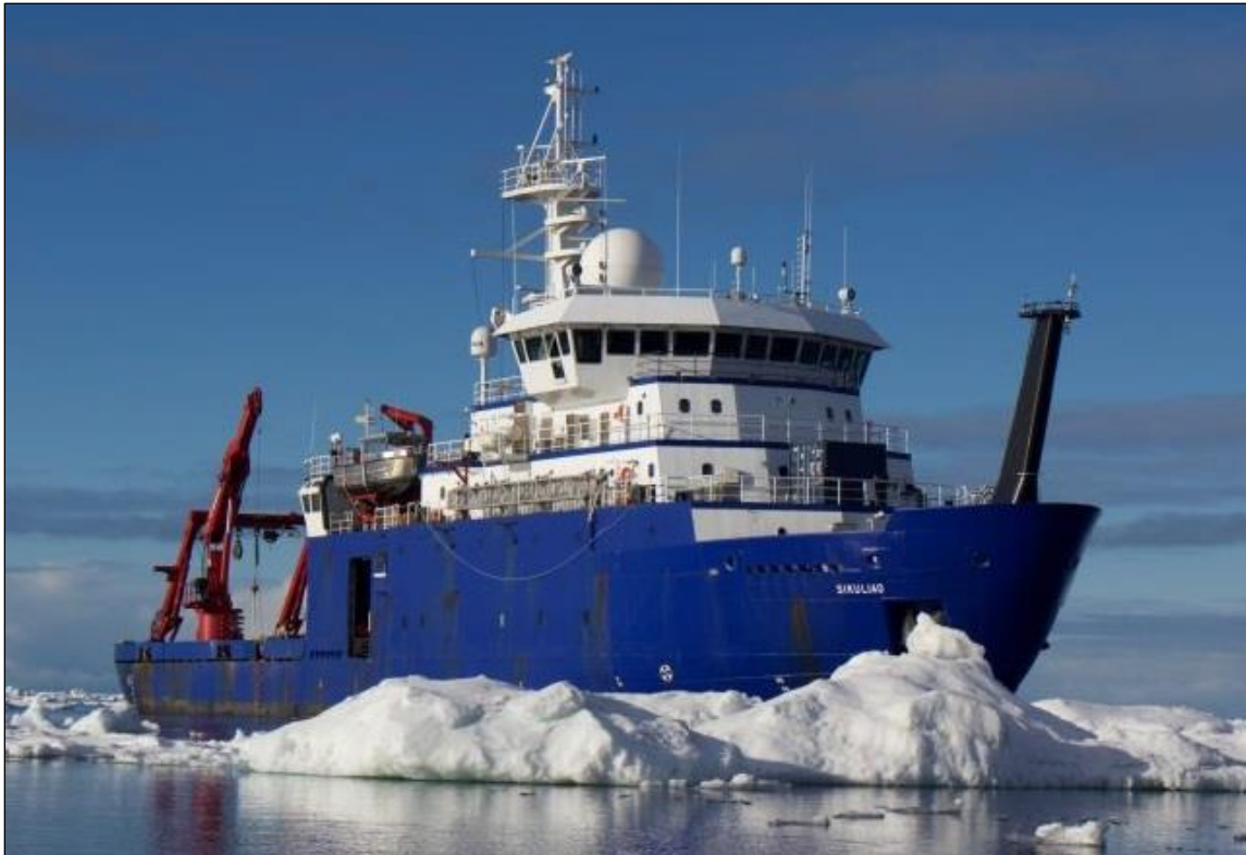
Figure A-6. Sikuliaq