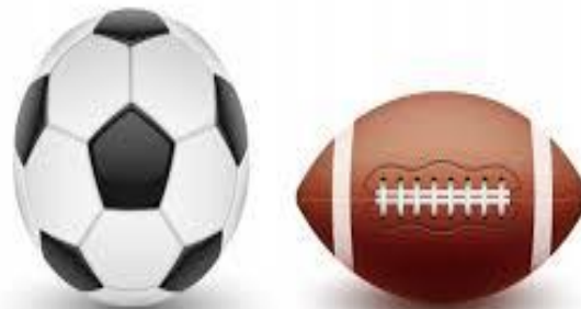
Sports soccer and football