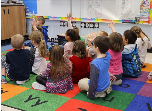
Students having good behavior.