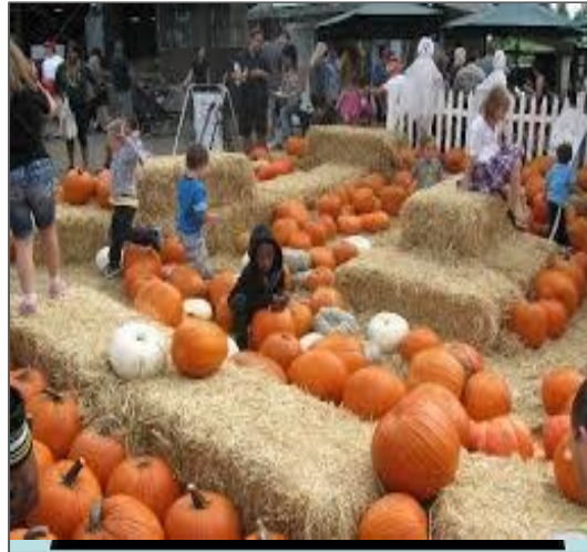
This is a picture of all the kids having fun with the pumpkins. There's mainly kinders having fun and the grown ups are the chaperones.

So today we are going to talk about ALL the kinders going to the pumpkin patch. And all of them were really excited! So am I. This all took place at the E.Z. Orchards! The field trip started at 9:00 am to 12:00 pm. All the teachers, kids, even parents got to go! The parents are the shaporones. They are the people who make sure the kids don't go anywhere! Not on my watch! And I know that when I was little, I slipped in the corn maze. Well, anuff about me! Let's get back to the part of the ALL the kinders and their time!