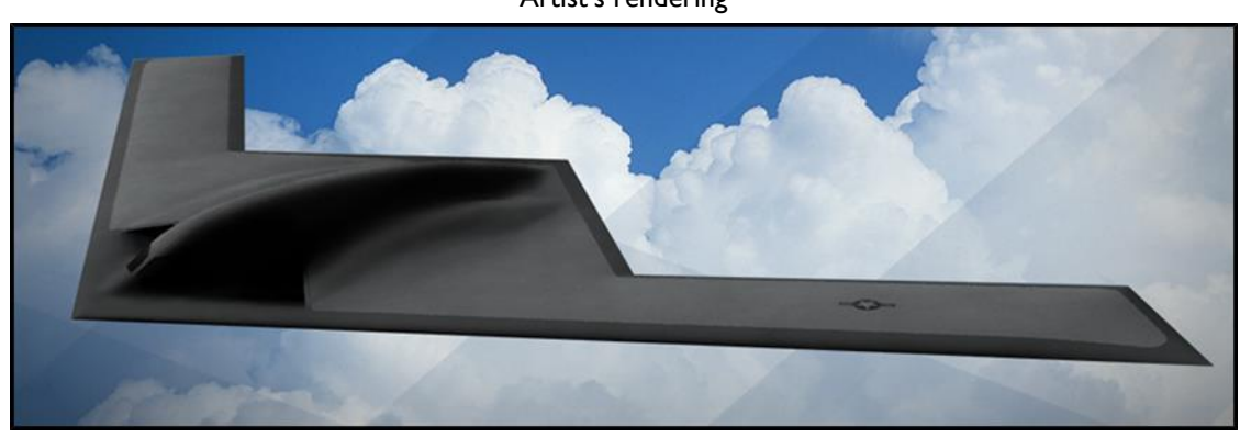
Figure 1.B-21 Artist's rendering

The B-21 is one of the Air Force's top three procurement priorities.<sup>4</sup>