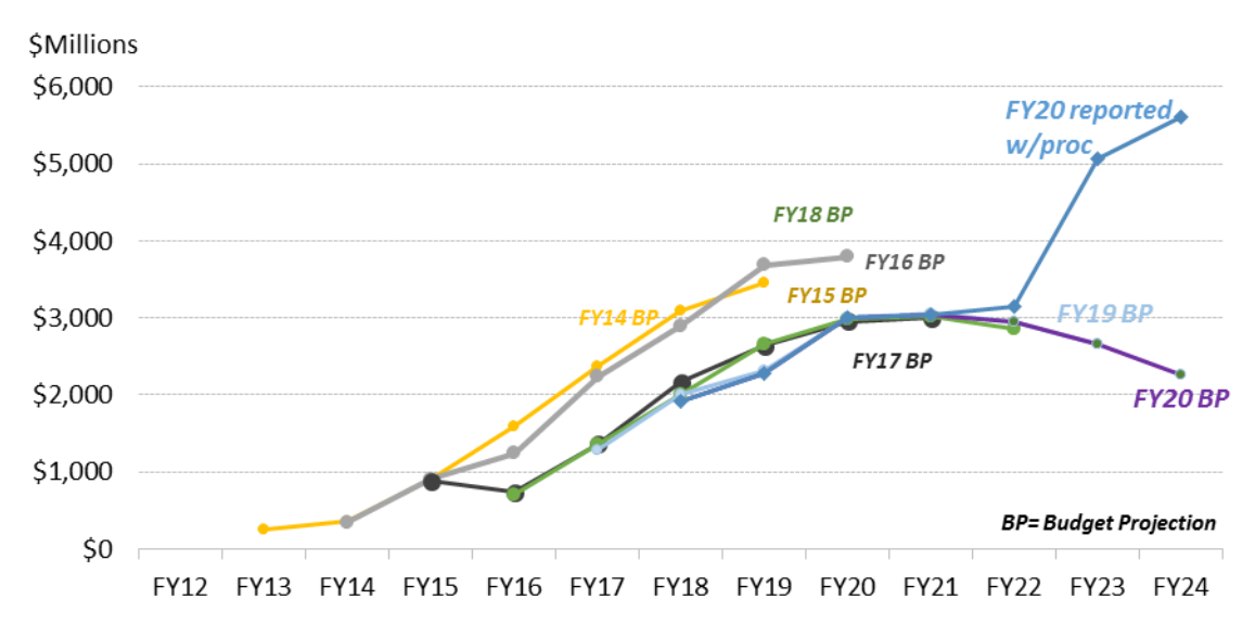
Figure 2. Proposed B-21 Outyear Funding