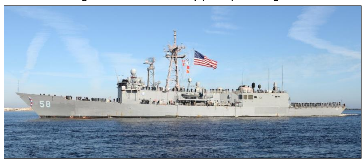
Figure 1. Oliver Hazard Perry (FFG-7) Class Frigate

The most recent class of frigates operated by the Navy was the Oliver Hazard Perry (FFG-7) class ( Figure 1 ). A total of 51 FFG-7 class ships were procured between FY1973 and FY1984. The ships entered service between 1977 and 1989, and were decommissioned between 1994 and 2015.