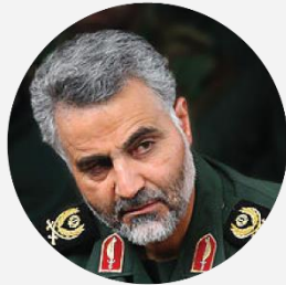
IRGC Major General Qasem Soleimani