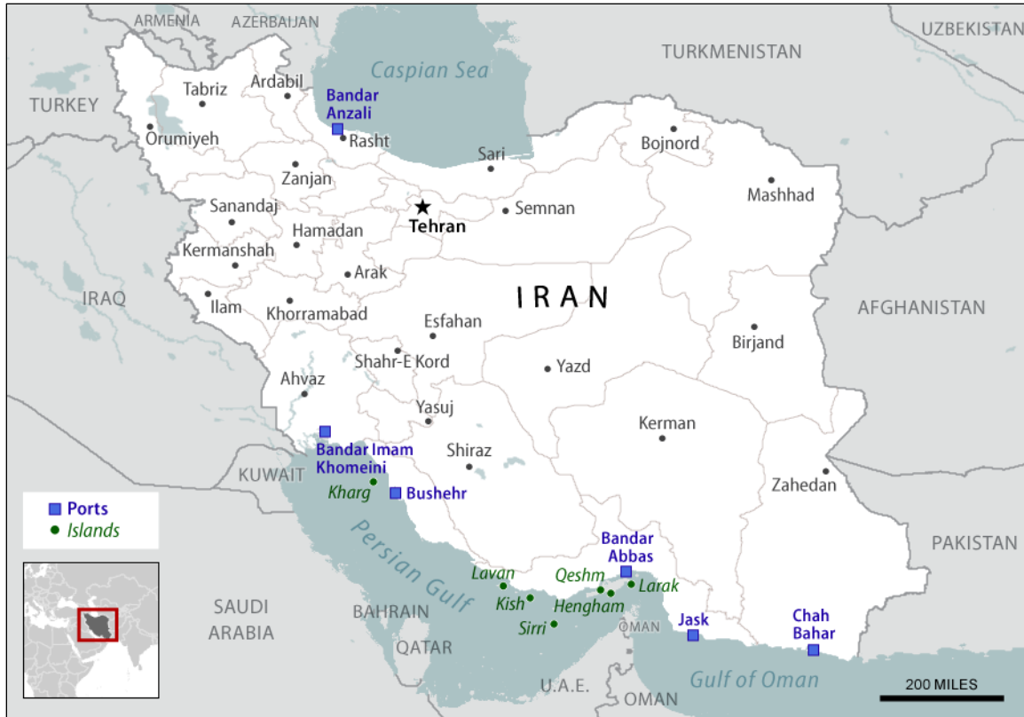
Figure 2. Iran, the Persian Gulf, and the Region