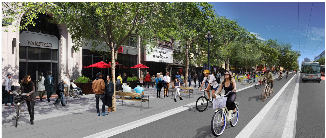
Figure 4. Proposed Project Visualization