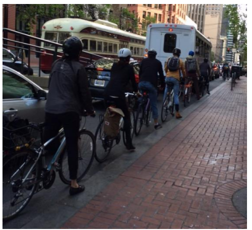
Figure 3. People biking on Market Street squeeze between cars queued and the sidewalk.

• Aging infrastructure: Many of the SFMTA's assets along Market Street are aging and in need of upgrade or replacement. This includes components of the Overhead Catenary System (OCS) that powers trolley coach buses and the F line. It also includes the traction power system that powers OCS (and Muni Metro), comprised of substations in Downtown (Stevenson Street) and Civic Center (UN Plaza) with underground duct banks that connect the substation power to the OCS. Finally, it also includes the F line track and the traffic signal system. As assets age, they require greater levels of maintenance and result in more frequent transit and traffic disruptions and ultimately require major upgrades or replacement to prevent failure. The traffic signals, in particular, have reached the end of their service lives, as many are suffering from extreme corrosion which renders them irreparable.