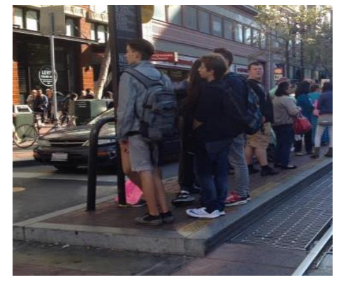
Figure 2. Existing narrow center-boarding islands are crowded and do not to provide wheelchair access.

• Accessibility challenges: Many elements of the SFMTA's Market Street assets need to be upgraded to better comply with current Americans with Disabilities Act (ADA) standards. Many center boarding islands are too narrow to provide accessible boarding to buses using the wheelchair lift/ramp. In addition, all of the F line stops will be made wheelchair accessible.