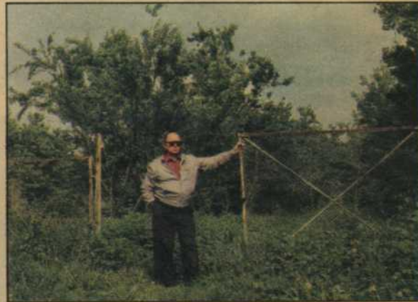
My father at the site outside Rovno where his father — and 18,000 other Jews — were killed.

At Birkenau, he saw SS men pull children away from their mothers and throw them onto trucks headed for gas chambers. He saw an SS man thrust his walking stick down a dying man's throat.