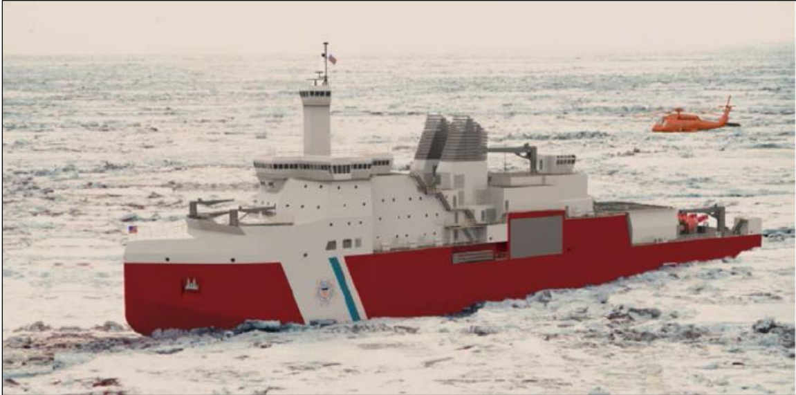
Figure 3. Rendering of VT Halter Design for PSC

Source: VT Halter press release, “VT Halter Marine Awarded the USCG Polar Security Cutter,” May 7, 2019, accessed May 8, 2019, at http://www.vthm.com/public/files/20190507.pdf .