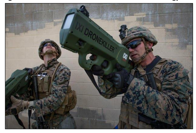
Figure I. Man-Portable Counter-UAS Technology