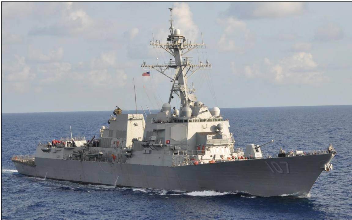
Figure 1. DDG-51 Class Destroyer