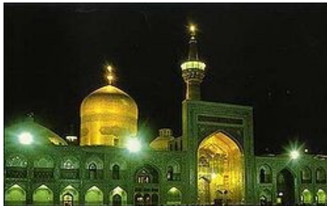
Photo of Imam Reza’s holy shrine in Mashhad, Iran, that is used as a brothel.

After the brothels were driven out of competition, the Islamic government turned holy shrines into ‘brothels’. ‘Gom’ the holiest shrine in Iran became the biggest and busiest whorehouse and the holy Shrine of Imam Reza in Mashhad became a demanding bordello. Visitors from Neighboring Arab states are accorded special privileges.