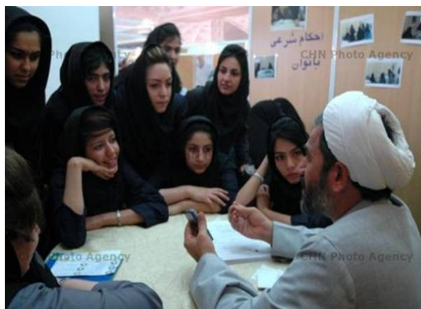
In his administration office, inside the holy shrine of Shiite’s 8 th caliph Arab Imam Reza in Mashhad, Iran, the pious pimp is soliciting to young prospects, sleeping with Arabs is rewarding and pleases Allah.

The official rate on the wall reads as follow: “ the rate for a young virgin sister! for a full day, is 70,000 toman, (approx. $26.00 on November 2017). A slightly used young girl is 30,000 toman, approx. $10.00. the sign also says one half of the proceeds shall go to the establishment.”