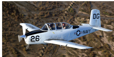
(3) Beechcraft T-34