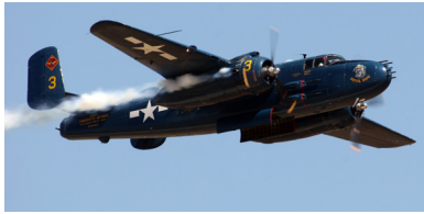
North American B-25/PBJ-1