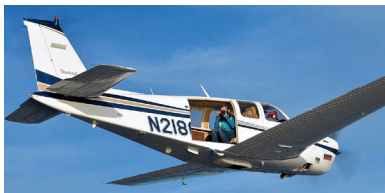
A-36 Bonanza (Photography Plane)