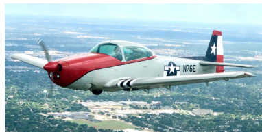
(3) Ryan L17 Navion