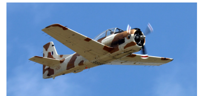
(2) North American T-28