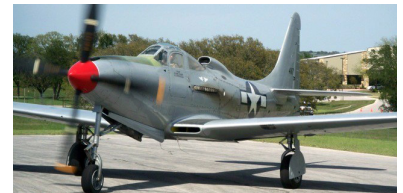
Bell P-63 King Cobra