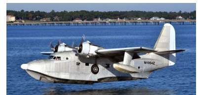
Grumman HU-16 Albatross