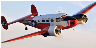
(3) Beechcraft BE-18/SNB