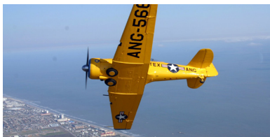
(8) North American AT-6/SNJ