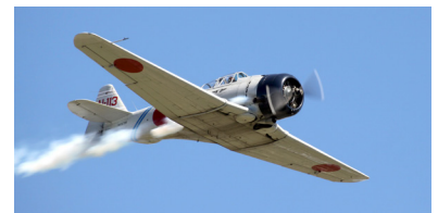
(3) Japanese Zero replica