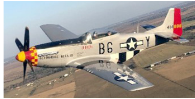
(2) North American P-51 Mustang