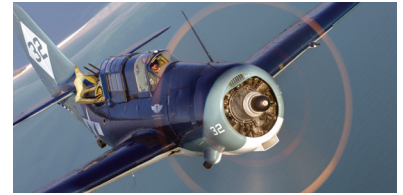
Curtiss SB2C Helldiver