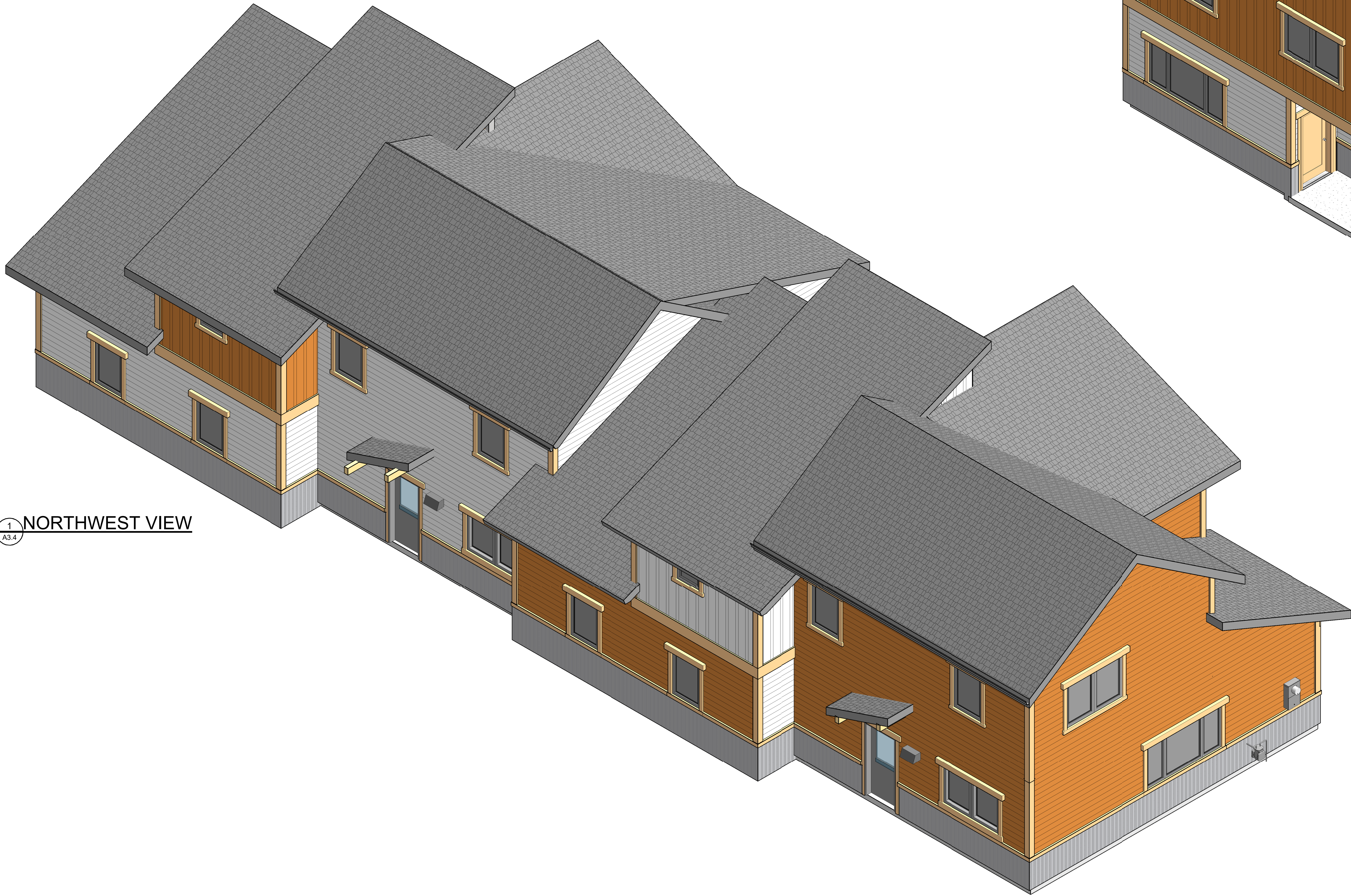
1 NORTHWEST VIEW A3.4