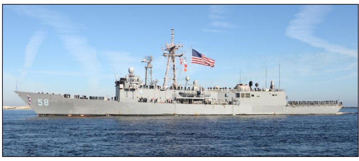
Figure 1. Oliver Hazard Perry (FFG-7) Class Frigate

The most recent class of frigates operated by the Navy was the Oliver Hazard Perry (FFG-7) class ( Figure 1 ). Atotal of 51 FFG-7 class ships were procured between FY1973 and FY1984. The ships entered service between 1977 and 1989, and were decommissioned between 1994 and 2015. In their final configuration, FFG-7s were about 455 feet long and had full load displacements of roughly 3,900 tons to 4,100 tons. (By comparison, the Navy's Arleigh Burke [DDG-51] class destroyers are about 510 feet long and have full load displacements of roughly 9,700 tons.) Following their decommissioning, a number of FFG-7 class ships, like certain other decommissioned U.S. Navy ships, have been transferred to the navies of U.S. allied and partner countries.