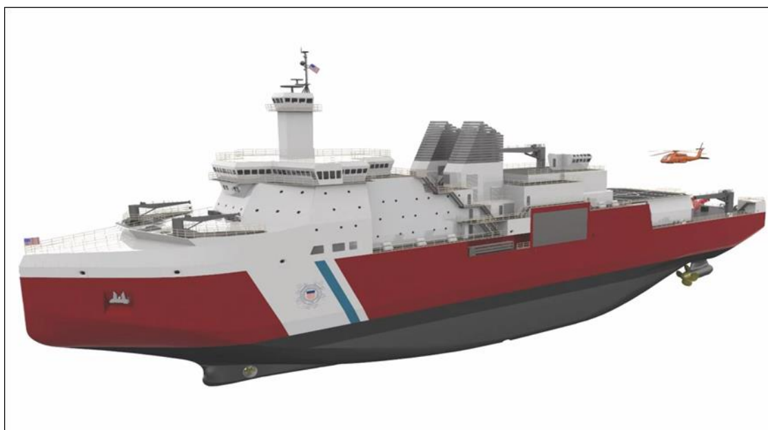
Figure 1. Rendering of VT Halter Design for PSC

Source: Illustration accompanying Sam LaGrone, "UPDATED: VT Halter Marine to Build New Coast Guard Icebreaker," USNI News , April 23, 2019, updated April 24, 2019. The caption to the illustration states "An artist's rendering of VT Halter Marine's winning bid for the U.S. Coast Guard Polar Security Cutter. VT Halter Marine image used with permission."