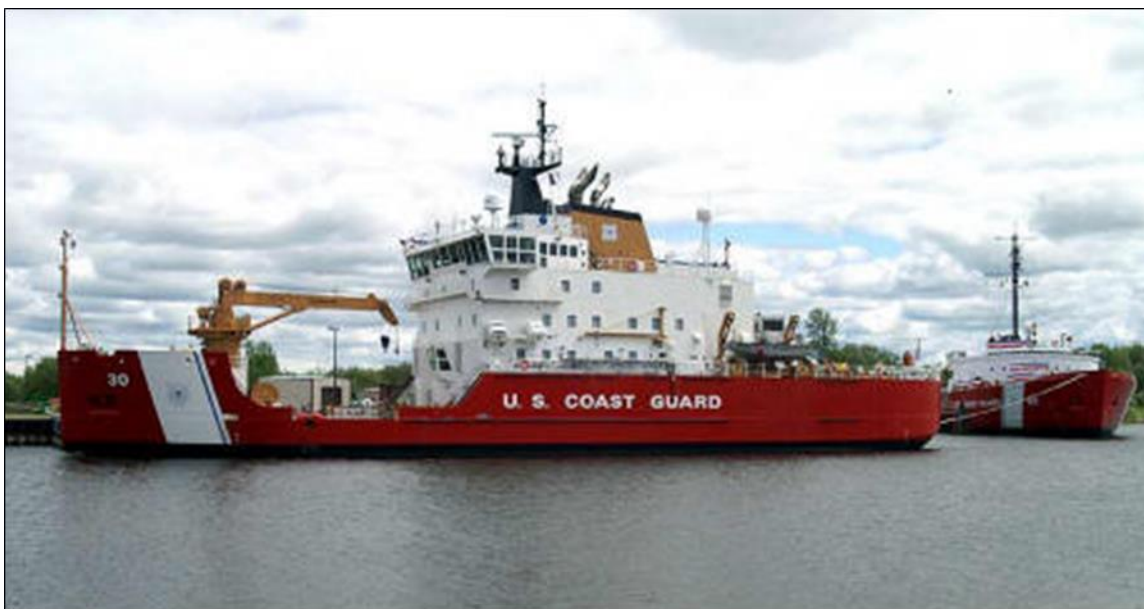
Figure E-1. Great Lakes Icebreaker Mackinaw