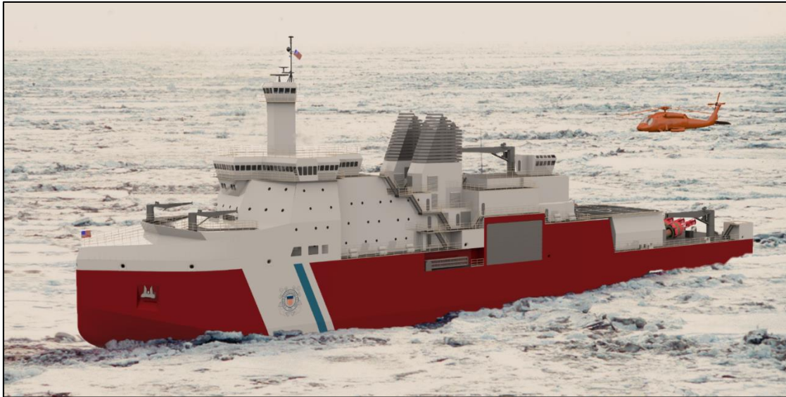
Figure 3. Rendering of VT Halter Design for PSC

Source: Technology Associates, Inc. (cropped version of rendering posted at http://www.navalarchitects.us/pictures.html , accessed June 10, 2020). A similar image was included in VT Halter press release, “VT Halter Marine Awarded the USCG Polar Security Cutter,” May 7, 2019, accessed May 8, 2019, at http://www.vthm.com/public/files/20190507.pdf .