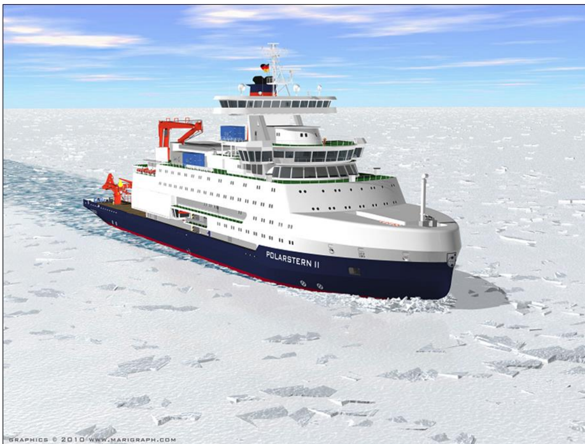
Figure 5. Rendering of SDC Concept Design for Polarstern II