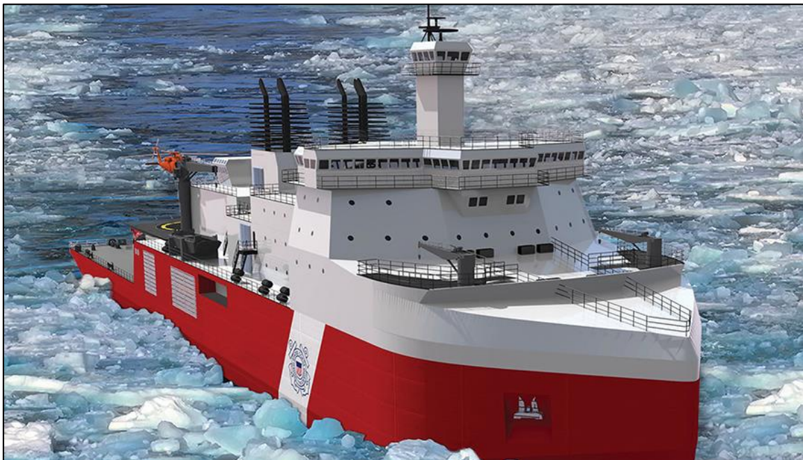
Figure 4. Rendering of VT Halter Design for PSC