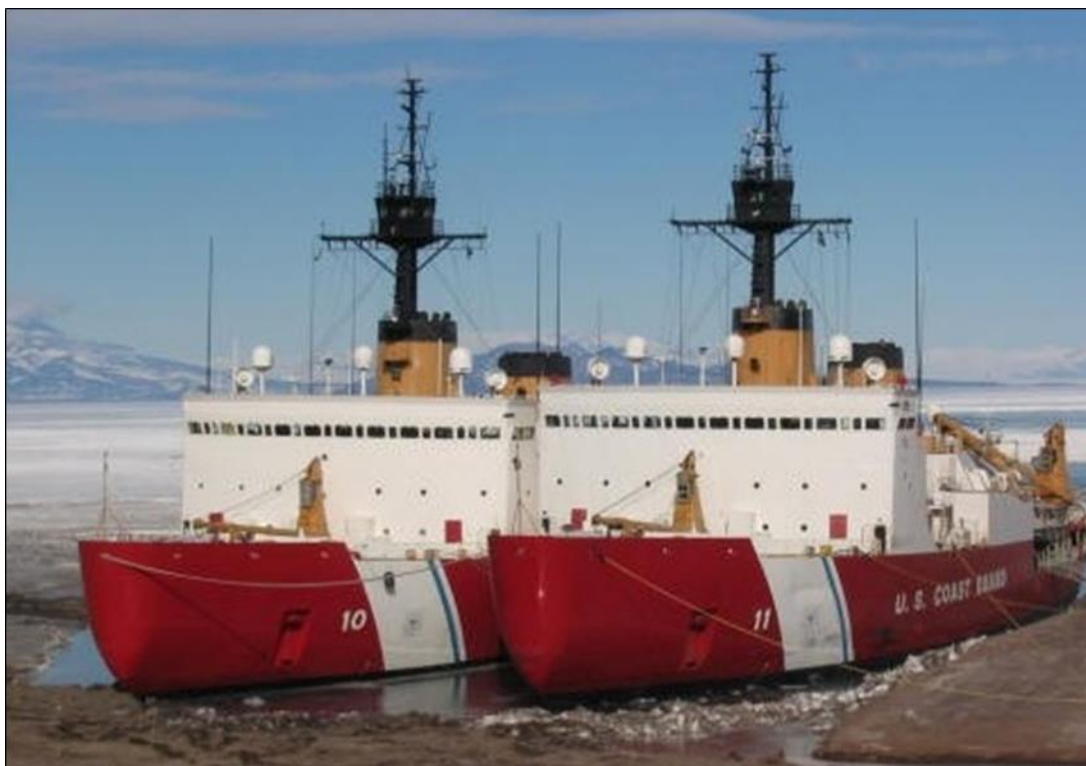
Figure A-1. Polar Star and Polar Sea (Side by side in McMurdo Sound, Antarctica)

Source: Coast Guard photograph that was accessed on April 21, 2011, at http://www.uscg.mil/pacarea/cgcpolarsea/history.asp (link no longer active). The photograph accompanies Kyung M. Song, “Senate Passes Cantwell Measure to Postpone Scrapping of Polar Sea Icebreaker,” Seattle Times , September 22, 2012, posted at http://blogs.seattletimes.com/politicsnorthwest/2012/09/22/senate-passes-cantwell-measure-to-postpone-scrapping-of-polar-sea-icebreaker/ .