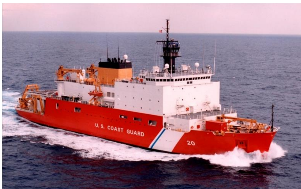
Figure A-3. Healy