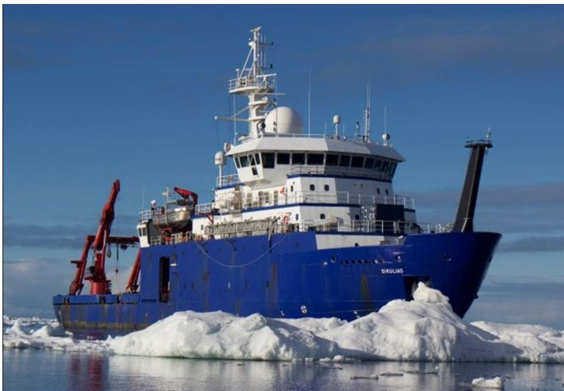
Figure A-6. Sikuliaq