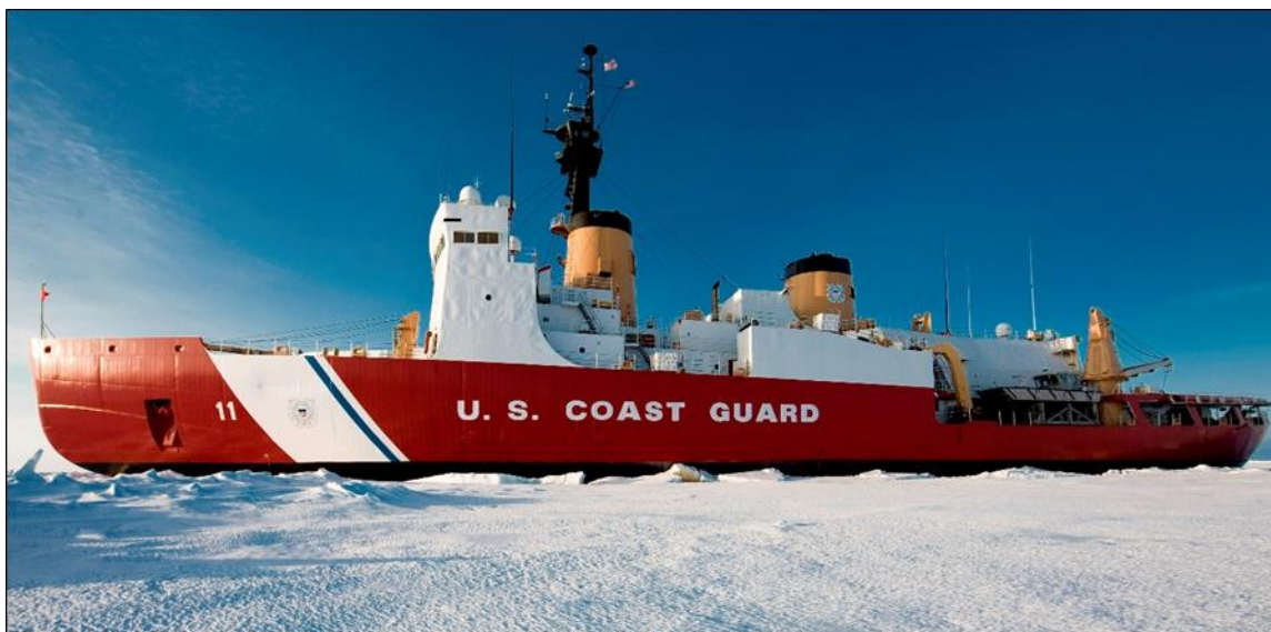
Figure A-2. Polar Sea

Source: Coast Guard photograph that was accessed April 21, 2011, at http://www.uscg.mil/pacarea/cgcpolarsea/img/PSEApics/FullShip2.jpg (link no longer active). The photograph accompanies Associated Press, “Reprieve for Seattle-Based Icebreaker Polar Sea ,” KOMO News, June 15, 2012, posted at https://komonews.com/news/local/reprieve-for-seattle-based-icebreaker-polar-sea .