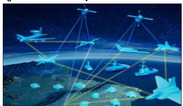
Figure 1. Visualization of JADC2 Vision