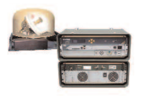
TRM-1000 SOTM Terminal

Note: All specifications subject to change without notice