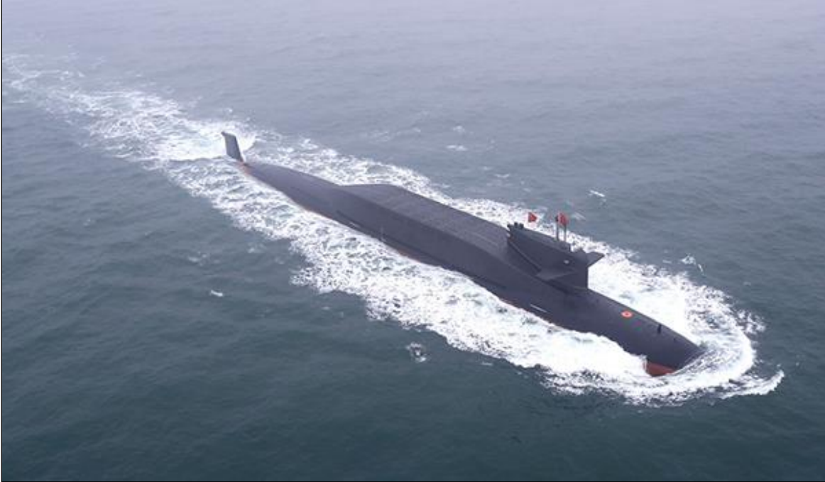
Figure 8. Jin (Type 094) Ballistic Missile Submarine (SSBN)