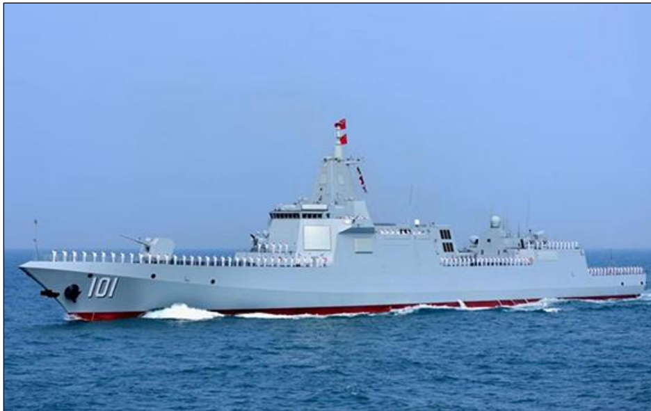
Figure 13. Renhai (Type 055) Cruiser (or Large Destroyer)