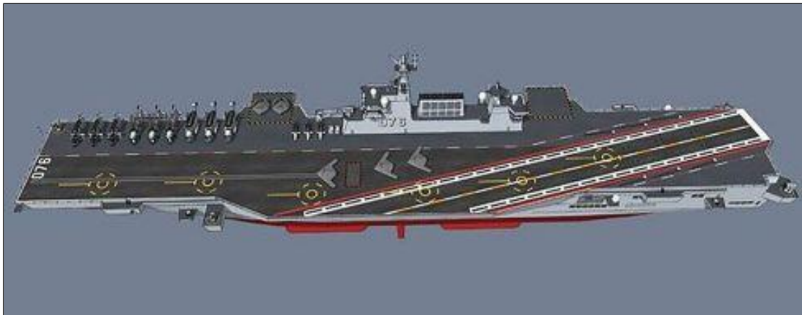
Figure 25. Notional Rendering of Possible Type 076 Amphibious Assault Ship