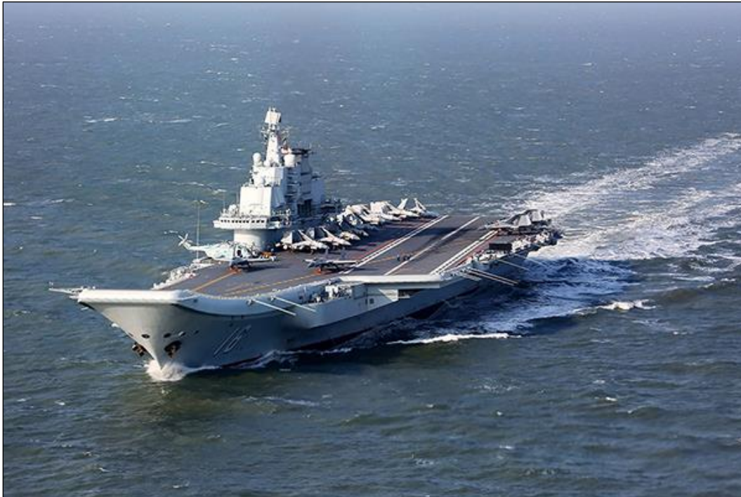
Figure 9. Liaoning (Type 001) Aircraft Carrier