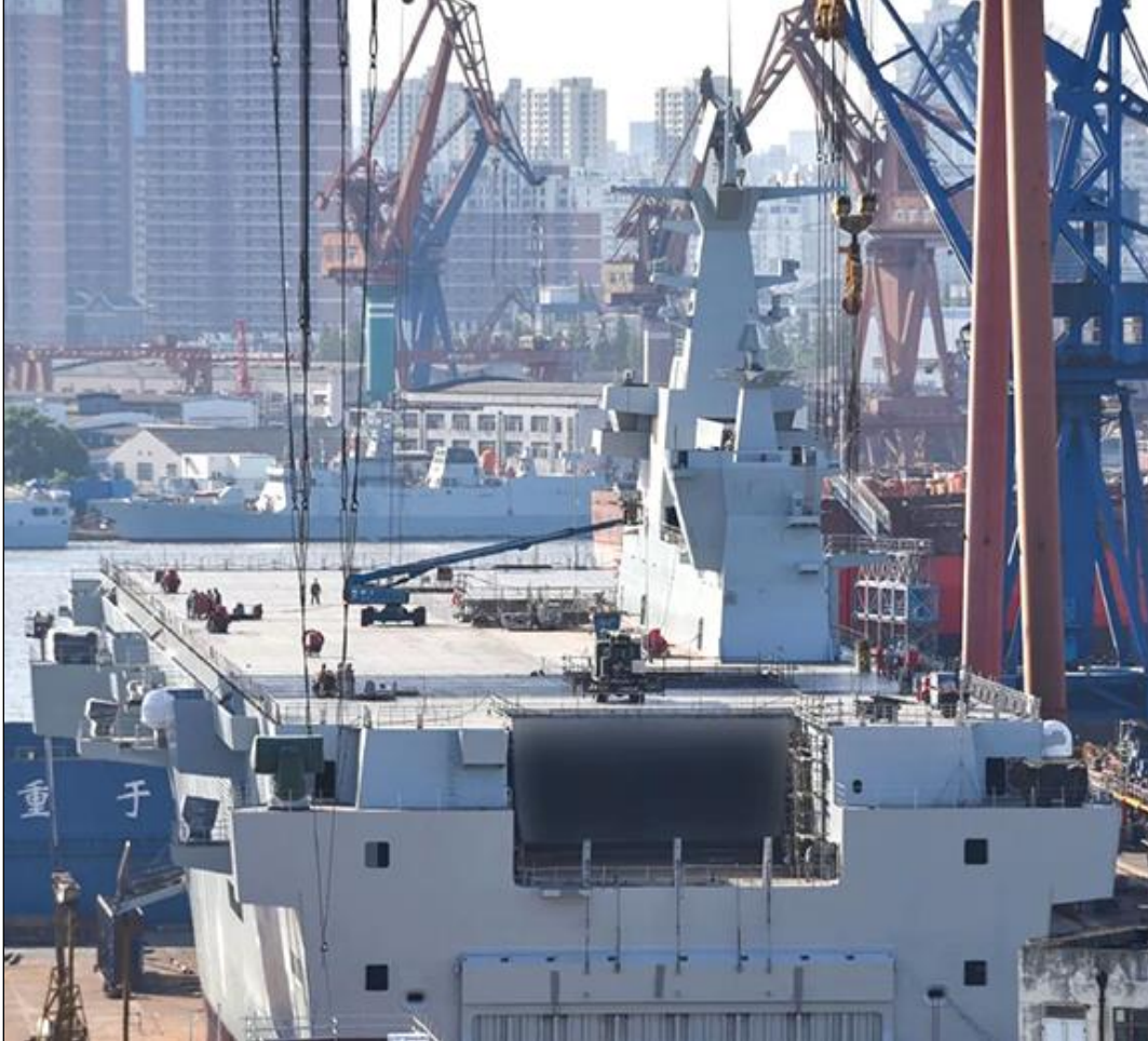
Figure 22. Type 075 Amphibious Assault Ship