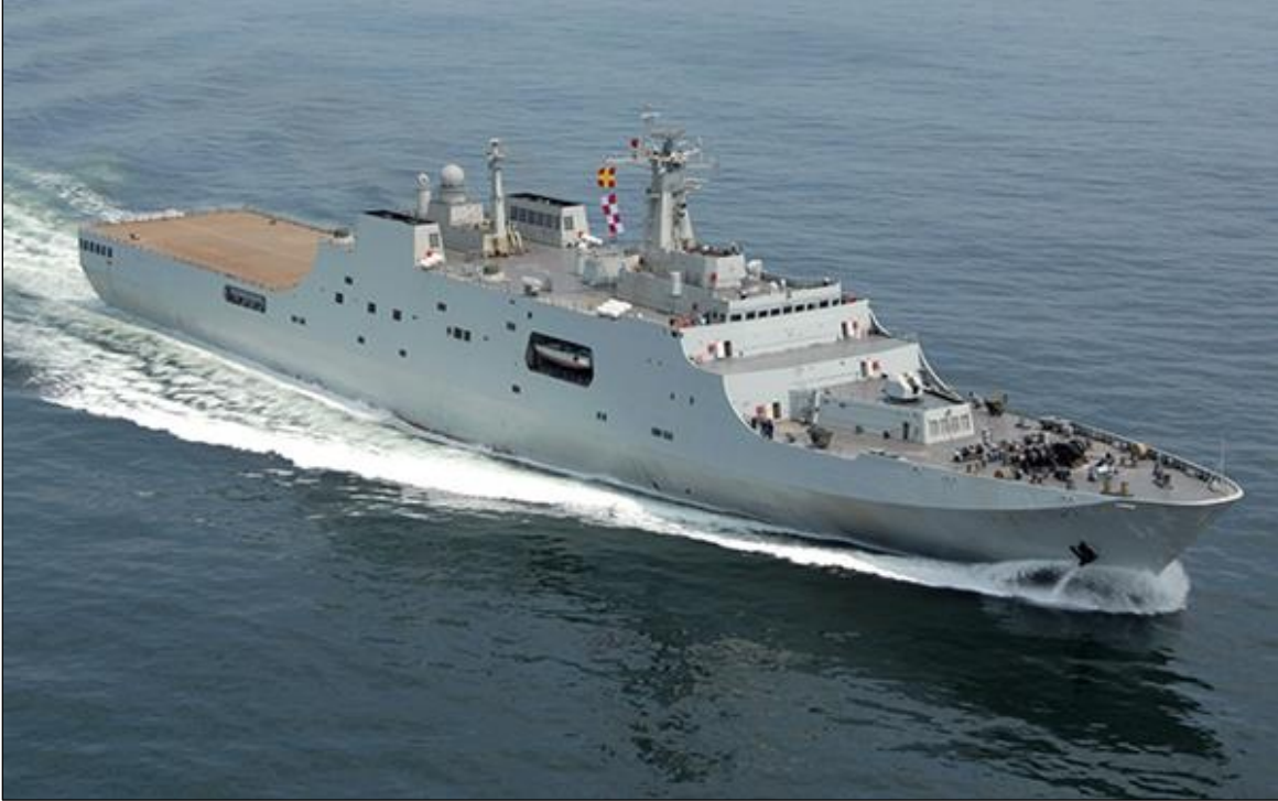
Figure 18. Yuzhao (Type 071) Amphibious Ship