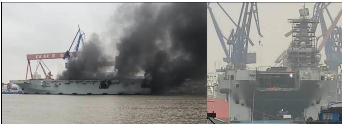
Figure 23. Type 075 Amphibious Assault Ship During and After Reported Fire