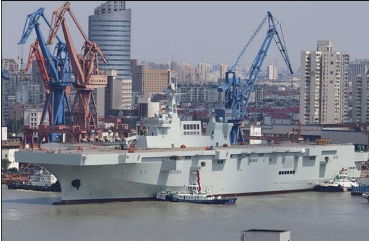
Figure 19. Type 075 Amphibious Assault Ship