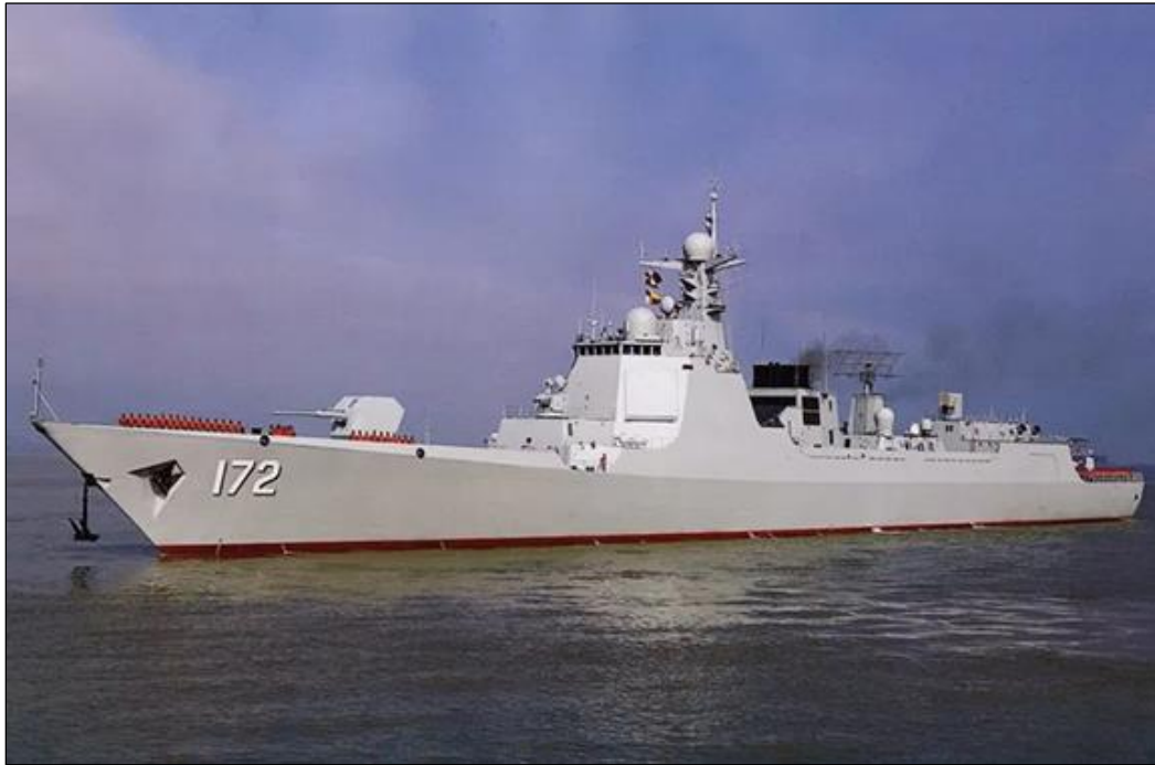
Figure 15. Luyang III (Type 052D) Destroyer