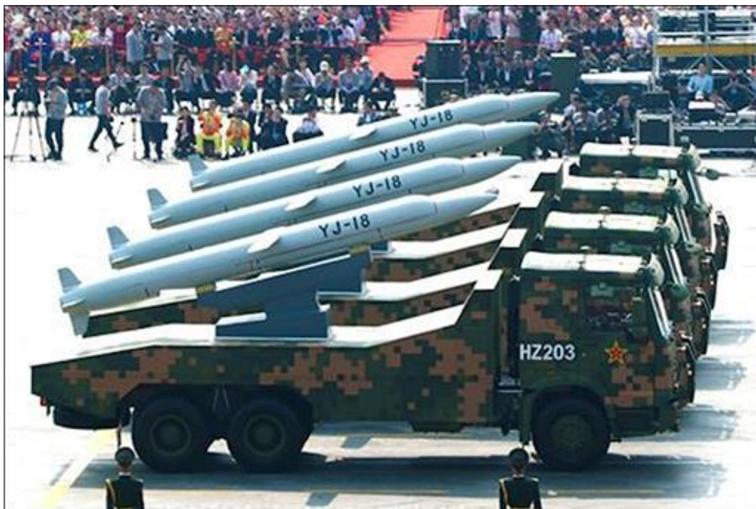
Figure 4. Reported Image of Anti-Ship Cruise Missile (ASCM)