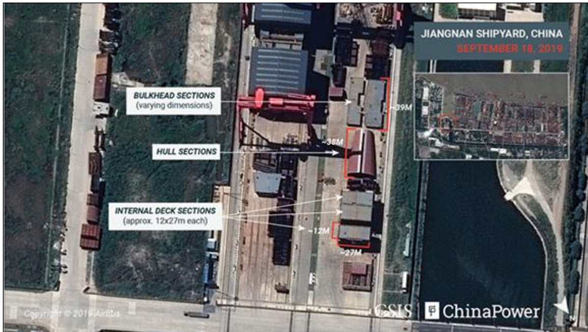
Figure 11. Type 002 Aircraft Carrier Under Construction