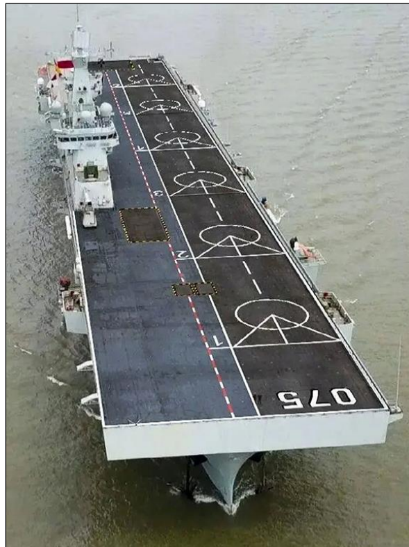
Figure 21. Type 075 Amphibious Assault Ship