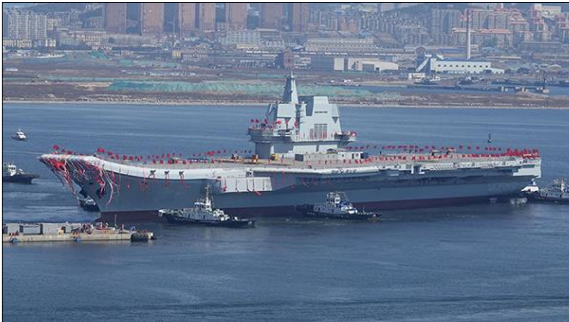
Figure 10. Shandong (Type 001A) Aircraft Carrier