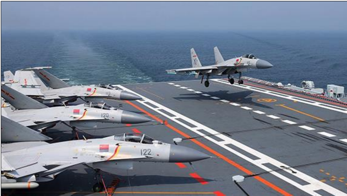
Figure 12. J-15 Flying Shark Carrier-Capable Fighter