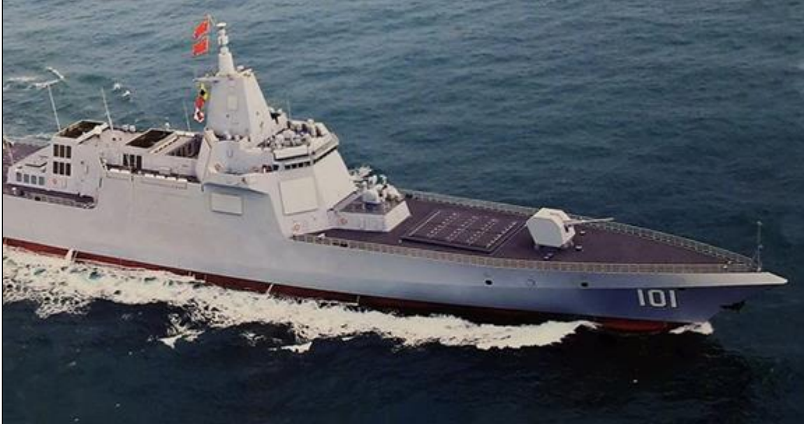
Figure 14. Renhai (Type 055) Cruiser (or Large Destroyer)