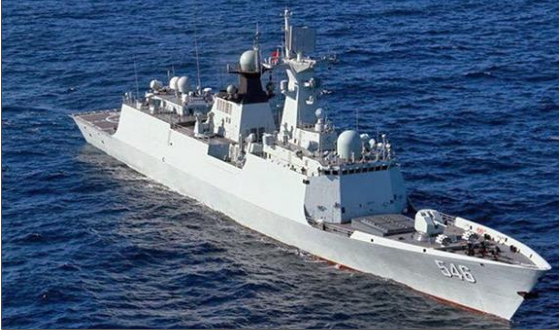
Figure 16. Jiangkai II (Type 054A) Frigate