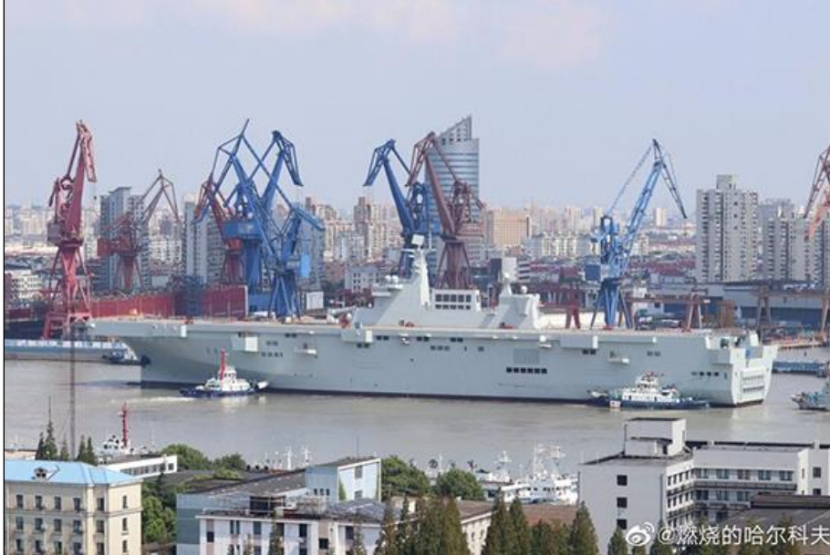
Figure 20. Type 075 Amphibious Assault Ship