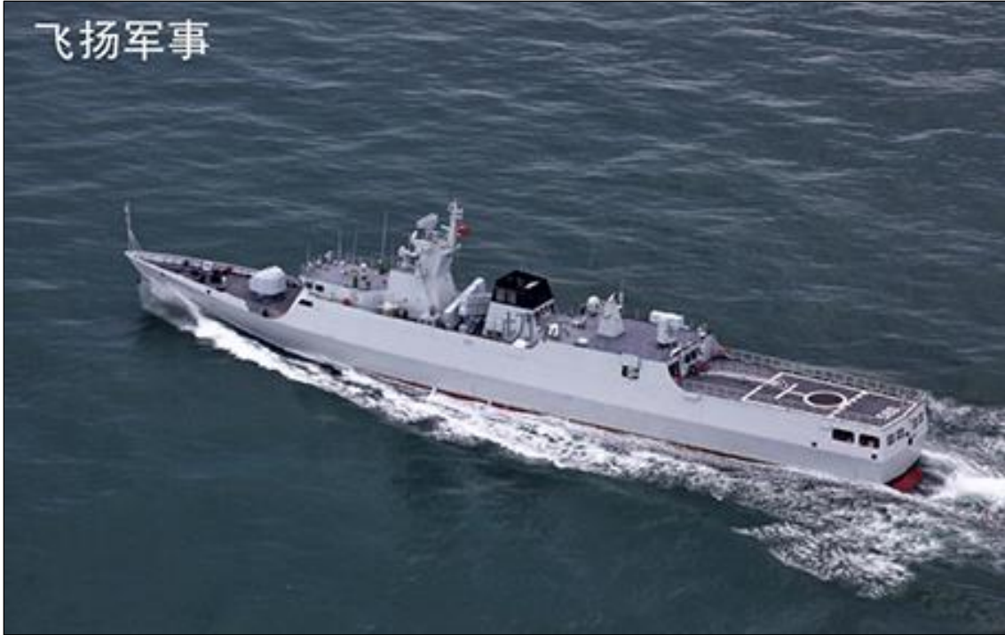
Figure 17. Jingdao (Type 056) Corvette