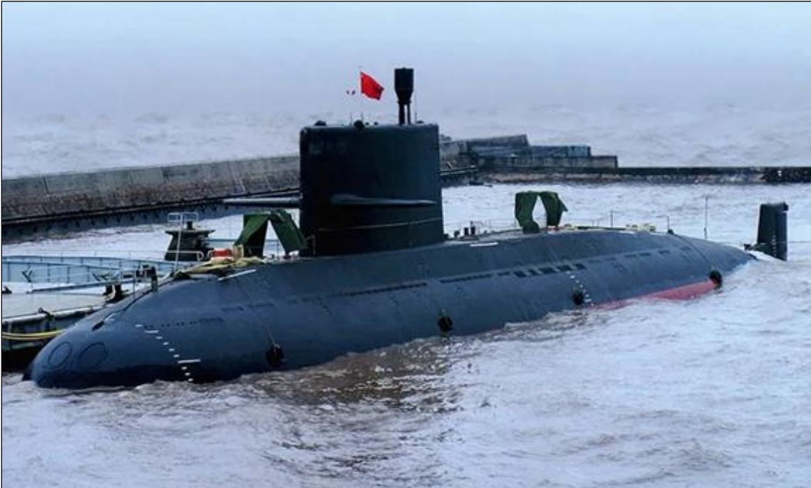
Figure 6. Yuan (Type 039) Attack Submarine (SS)