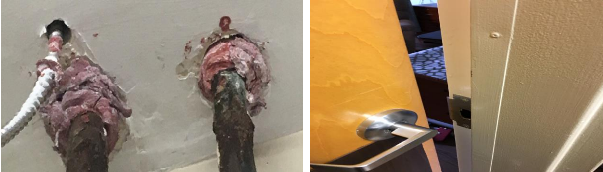
Photograph 1 (left): Missing fire caulking resulted in a deficient smoke or fire barrier.

The following photographs show some of the deficiencies we identified during our site visits.