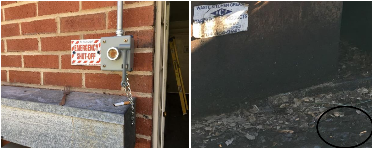
Photograph 7 (left): Cigarette butts were found near an emergency gas shutoff button.

The following photographs show some of the deficiencies we identified during our site visits.