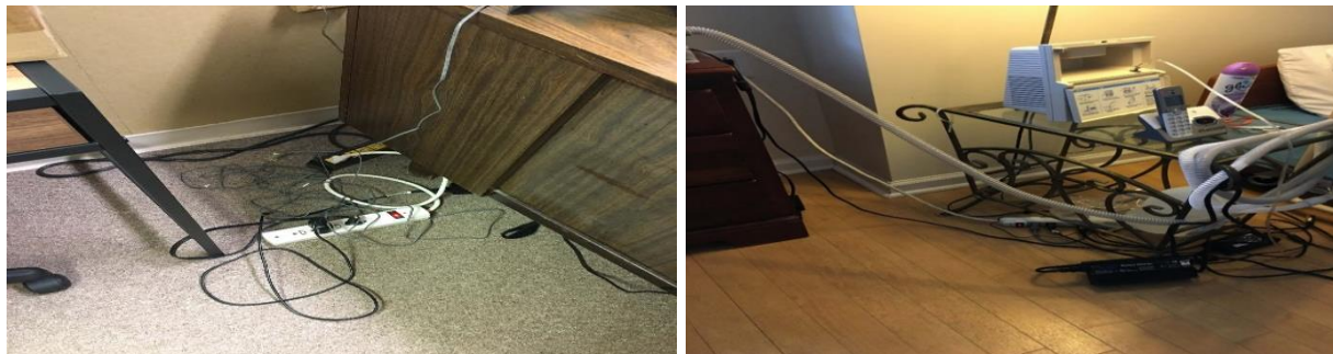
Photograph 9 (left): One power strip was connected to another power strip. Photograph 10 (right): An extension cord was being used in an unsafe manner.

The following photographs show some of the conditions we identified during our site visits.