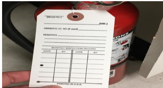
Photograph 3: A fire extinguisher lacked documentation of any inspections.