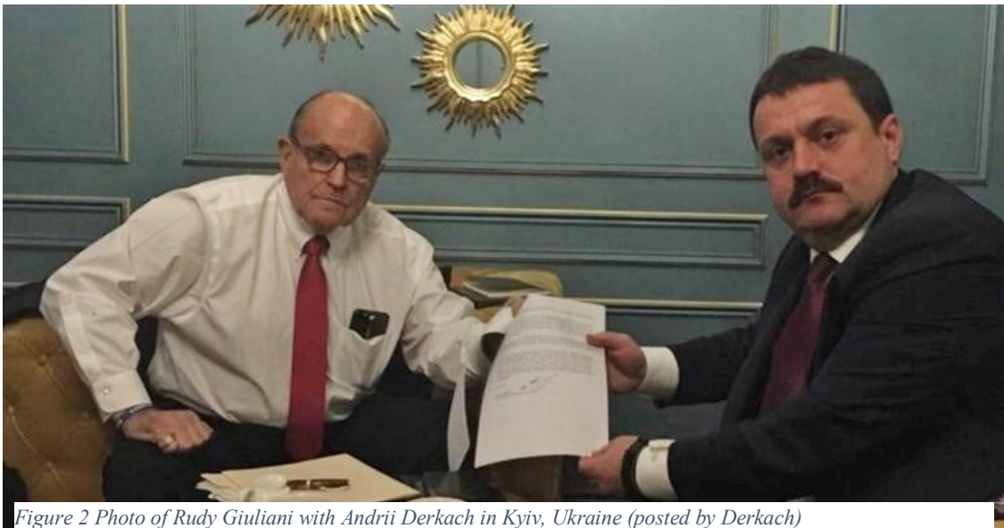
Figure 2 Photo of Rudy Giuliani with Andrii Derkach in Kyiv, Ukraine (posted by Derkach)