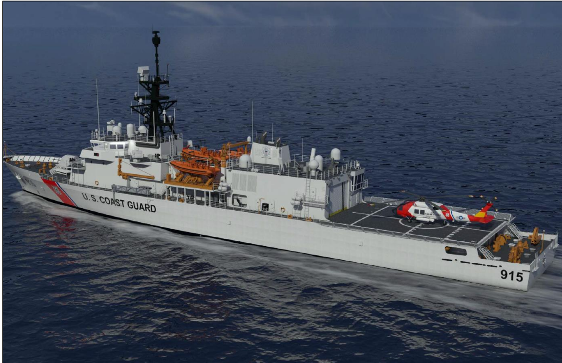
Figure 5. Offshore Patrol Cutter Artist's rendering